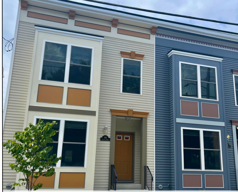
Finished homes on Orange Street, Albany