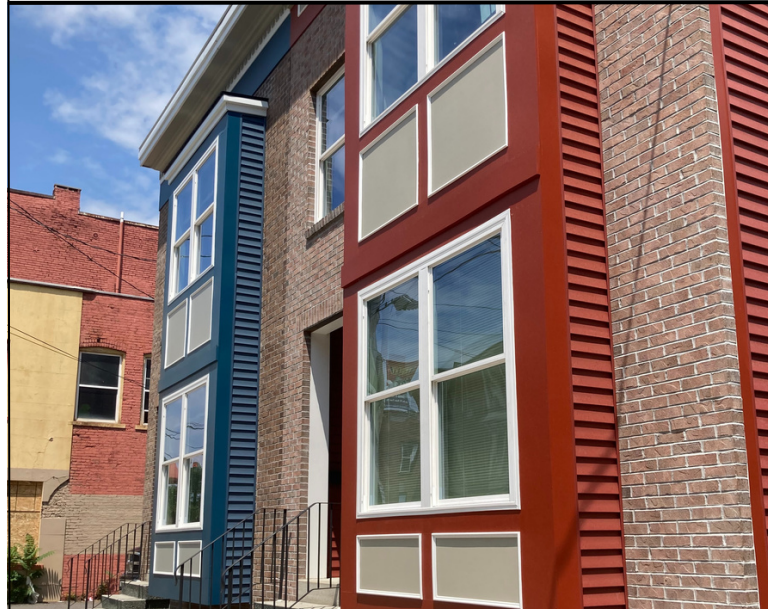
Finished homes on River Street, Troy