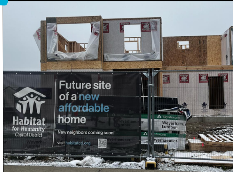
Construction on Manning Blvd, Albany

Learn more about where we build at habitatcd.org/where-we-build