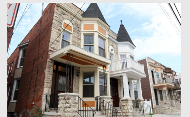
North Central Troy

That means there is a big gap to fill every time Habitat builds a home. What's our secret? Your generosity. Without it, the math just doesn't work.