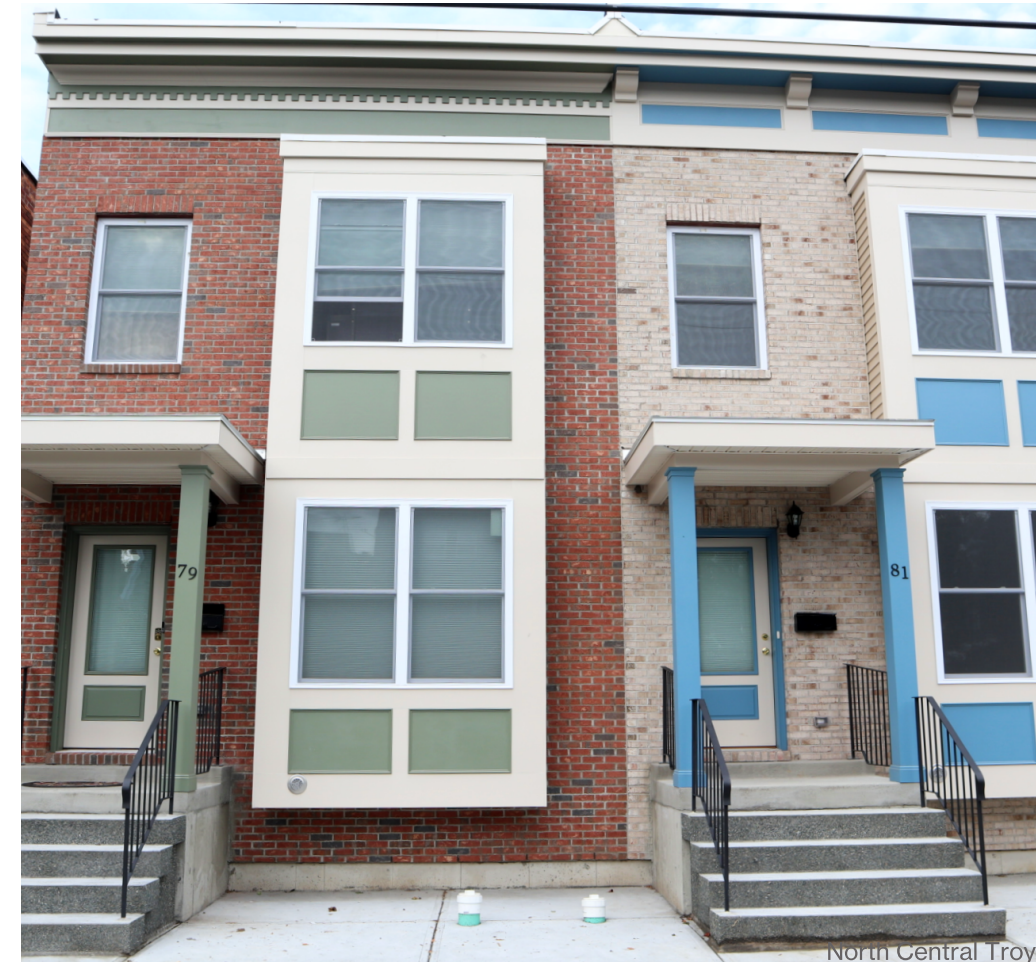
North Central Troy

We build strength, stability and self-reliance through affordable homeownership.