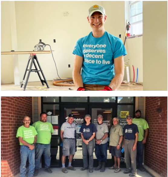
Meet our Board of Directors at habitatcd.org/team