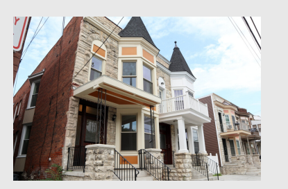
North Central Troy

That means there is a big gap to fill every time Habitat builds a home. What's our secret? Your generosity. Without it, the math just doesn't work.