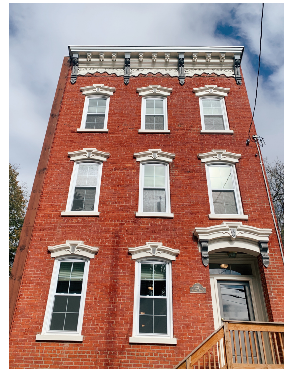
Fully rehabbed, two-family Habitat home in Albany's South End